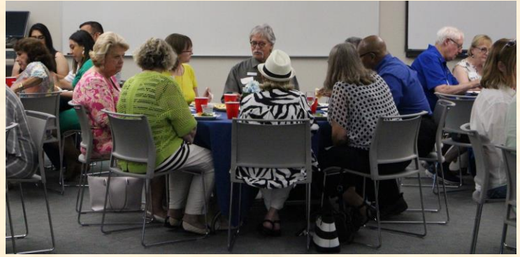
Center for Nonprofit Advancement Networking Events 2019