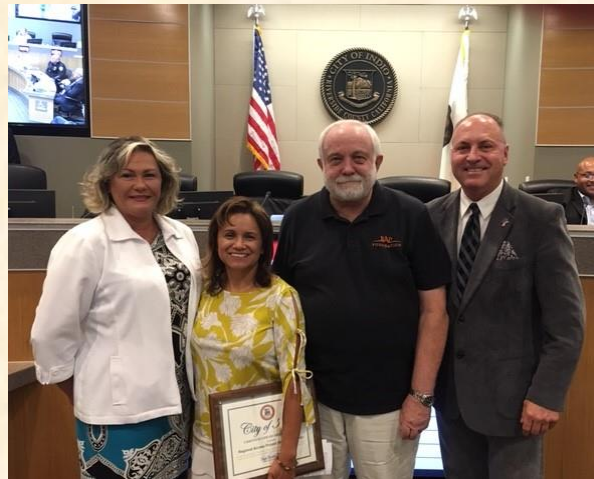
City of Indio Recognition of RAP and CNA May 2019