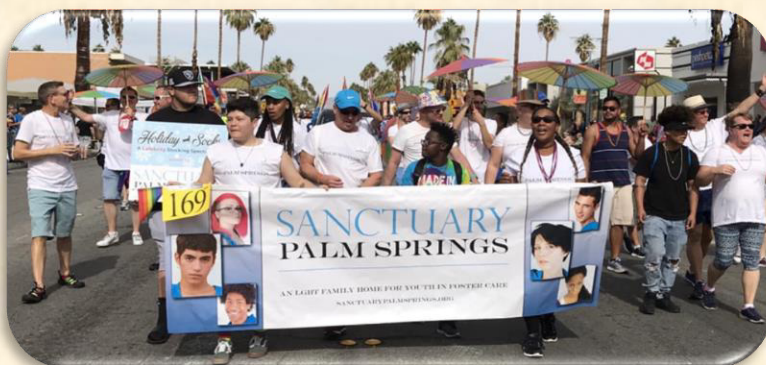
LGBT Parade February 2019