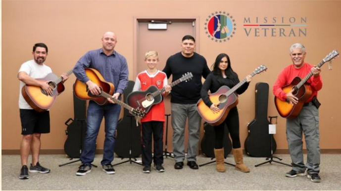
Mission Veterans Outreach Event Spring of 2019

The RAP Foundation was proud to support organizations that addressed Health, Mental Health and Juvenile Intervention by hosting community activities. These are only a few of the many successful events that took place this past year.