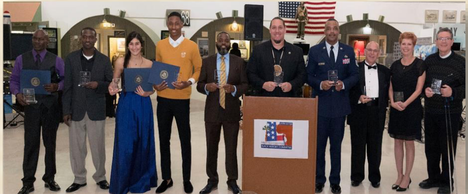
Black History Month Event at Palm Springs Museum February 2019