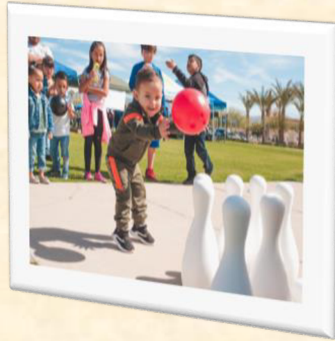
Day of the Young Child March 2019