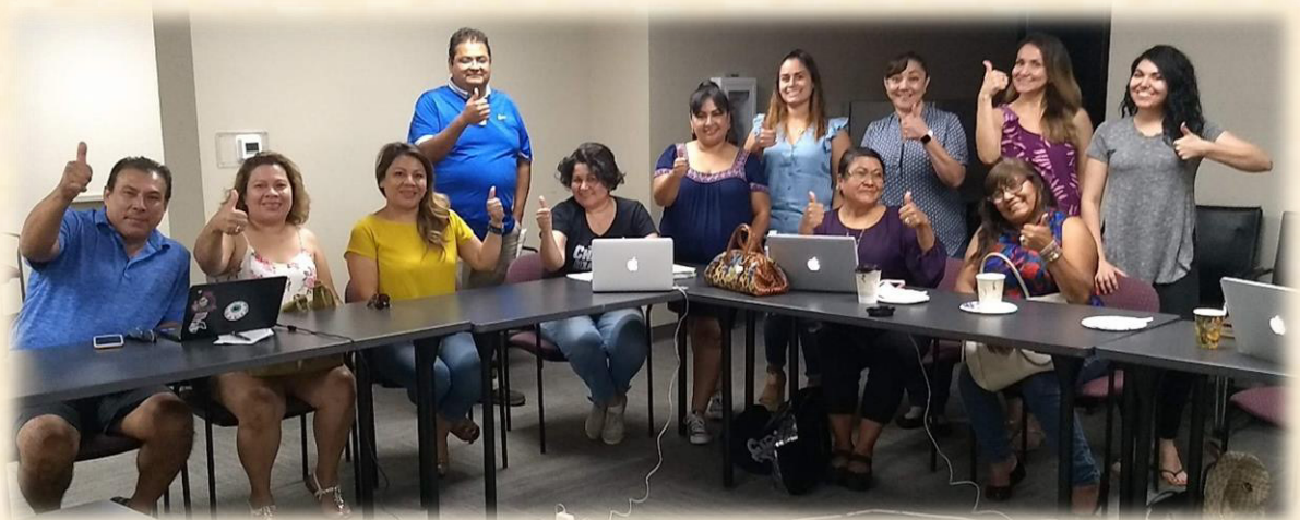
Lunes Digital Social Media Training June 2019