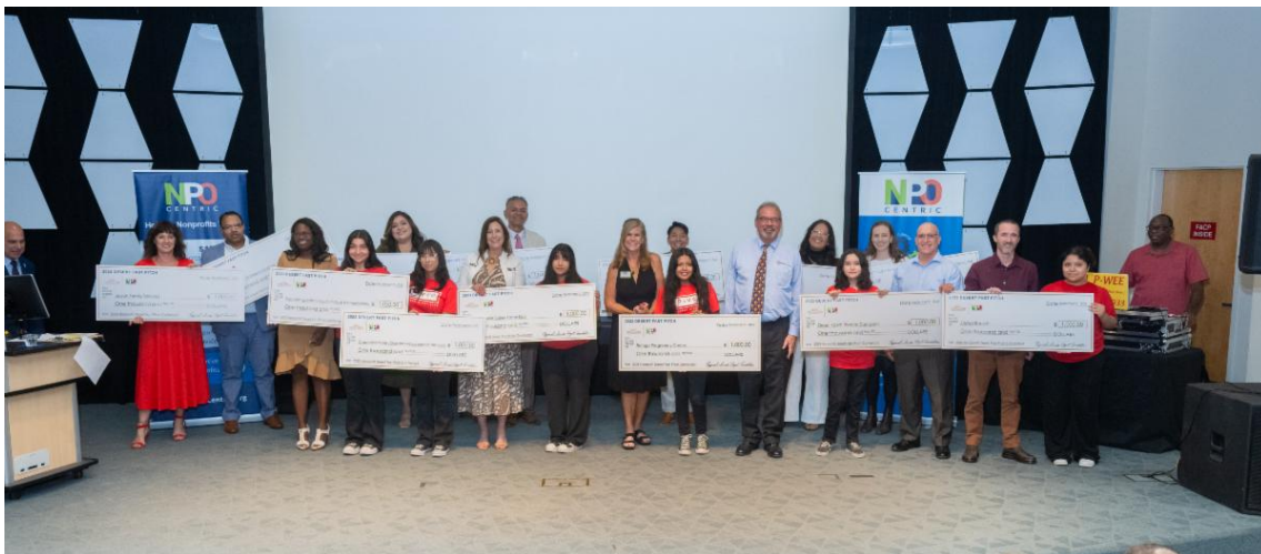
Pictured above: All of the 2023 participants were recognized on stage at the event. Friday Night Lights students helped in the check presentation.

The 10 th Annual Desert Fast Pitch event was held on September 21, 2023 and was probably our most successful yet.